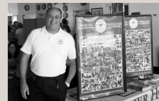
2010 Fort Gordon Agency Fair