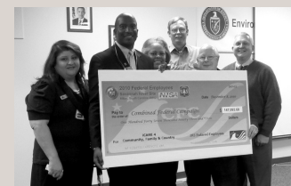
2010 DOE Check Presentation